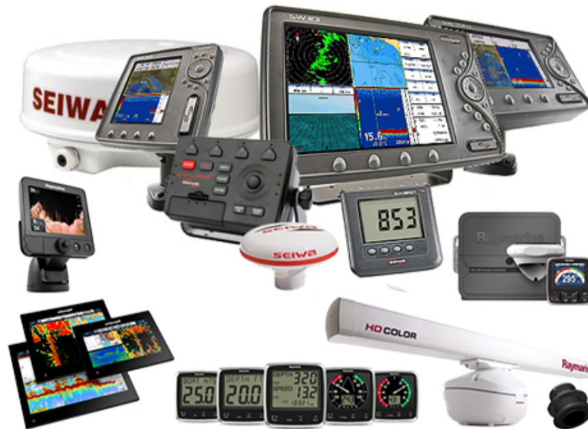
Pictures are stock images and are not indicative of the actual business